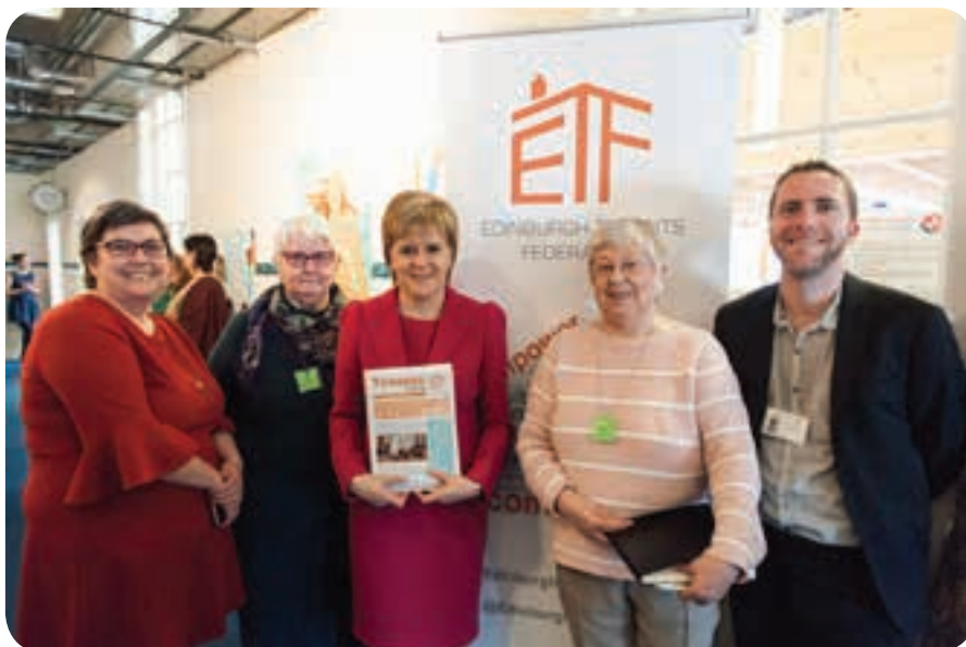
The First Minister with members of ETF's Executive Committee and staff