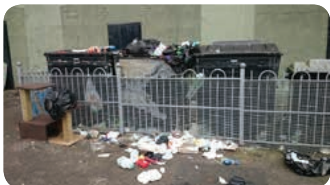
Some of the problems regarding waste services in the area