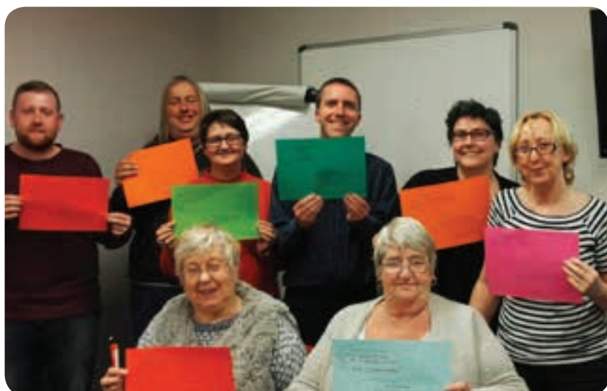
EC members and staff enjoying themselves at the human rights training