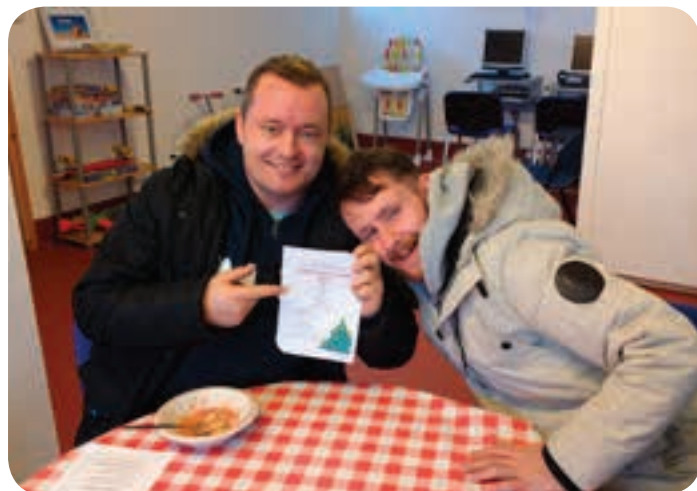
The community kitchen has proven to be very popular