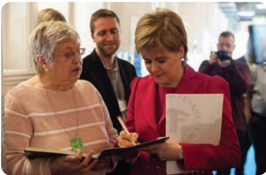
The First Minister signing ETF’s visitor book

The Federation’s Executive Committee recently approved a statement on behalf of its Members opposing the introduction of the “Rape Clause” saying “Edinburgh Tenants Federation is disgusted by the introduction of the “rape clause”. This is an inhumane policy that should never have been approved. We call for the UK Government to rethink this law. Women should never have to disclose that their child has been conceived as a result of rape or coercion in order to receive state benefits.”