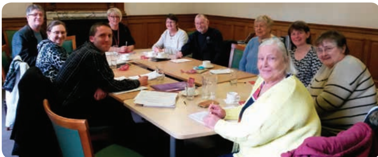
The Inspectors and ETF staff meet with Council staff

The next stage in the fieldwork process is to hold discussion groups with Council tenants about their experience of rent collection communication. There will be a further update on the TLI work in the next edition of Tenants Voice .