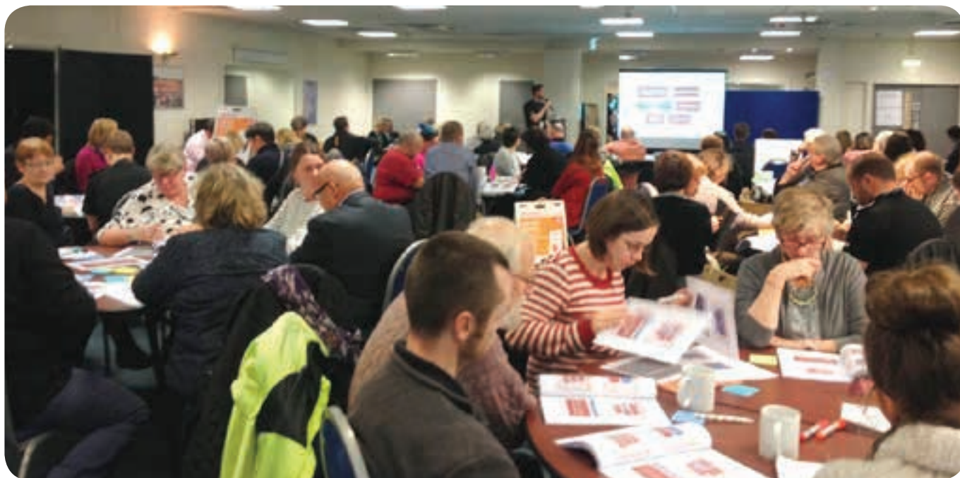
A consultation event held to discuss developing LIPs

We have been asking for people's views to help us to do this, as it's vitally important that our citizen's views are at the heart of the Locality Improvement Plans. We've carried out the first phase of engagement, listening to those people living, working or visiting the wider locality about their views on how each area could be improved in the next five years around the following five themes: place; health, social care and wellbeing; children, young people and families; community safety; and employability.