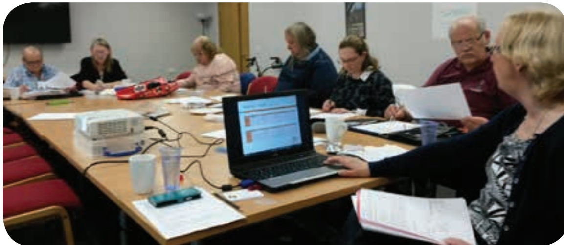
Discussions taking place at the learning session

By the end of the session, learners reported increased confidence and understanding about how to run their group's finances.