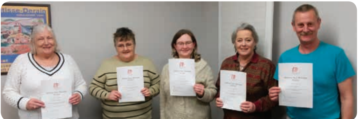
Delegates receive their certificate for completing the course

Some of the feedback from the session included