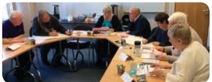
Identifying priorities for ETF at the EC Review Day

A Work Plan for 2017-2018 will be approved at our Annual General Meeting on Friday 16 th June 2017. Come along to have your say on the future work of the Federation.