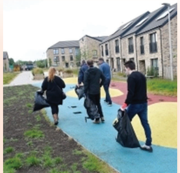
We were very pleased with the results of the Craigmillar Week of Action