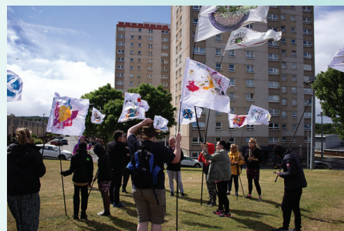
The flag march through Moredun

During the week beginning 20th June the Waveparticle artist began the process of community engagement by speaking to the residents to see what they wanted and needed from the green space. This was done by setting up a gazebo in a different place each day, chatting with passers-by and making flags to highlight the key areas in the space. At the end of the week the community artist put on a spontaneous flag march. This was a huge success and we are looking forward to seeing what comes next from this work.