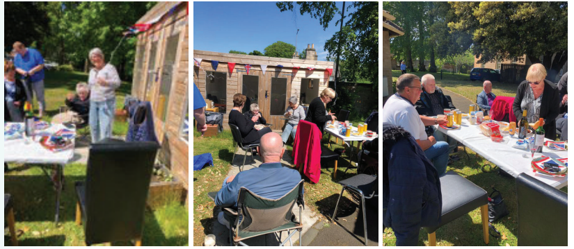
Everyone enjoying themselves at the Jubilee Barbeque