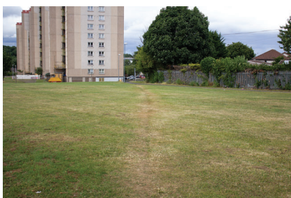
The green space in Moredun

Two years ago, CEC were in the process of planning to build 188 homes on the beloved Moredunvale green space. This is a very special piece of land for the people living in Moredun and residents decided to take action. After a peaceful protest and a lot of meetings between CEC and the local residents' association Moredun Multis and Maisonettes Residents Association (MMMRA), CEC shelved plans to build homes on the greenspace. Ongoing discussions have been taking place between CEC and MMMRA to decide the best use for the greenspace. It was agreed to hire a community artist from Waveparticle.