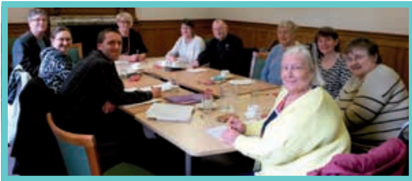
The TLIs and Council staff planning the Rent Collection Communication Inspection

The inspection will be completed by the end of summer 2017.