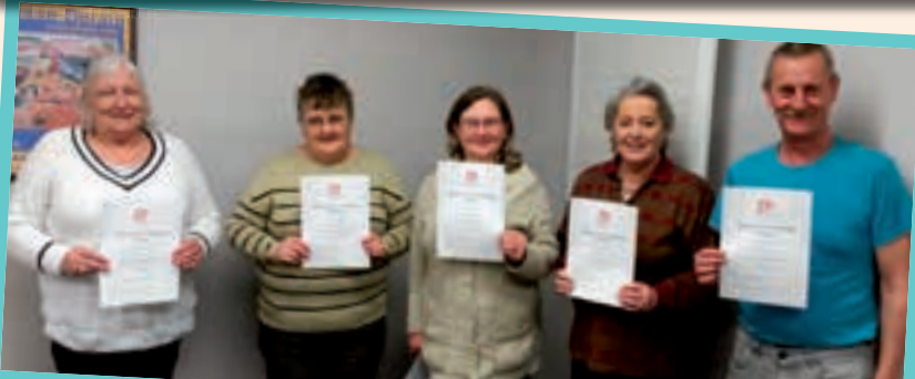
ETF learners at the 'Getting Your Message Across' Learning Session.