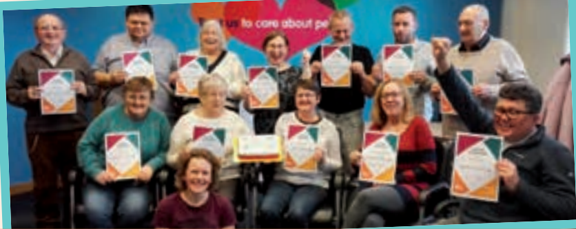
Tenant representatives completed the Leadership Programme.