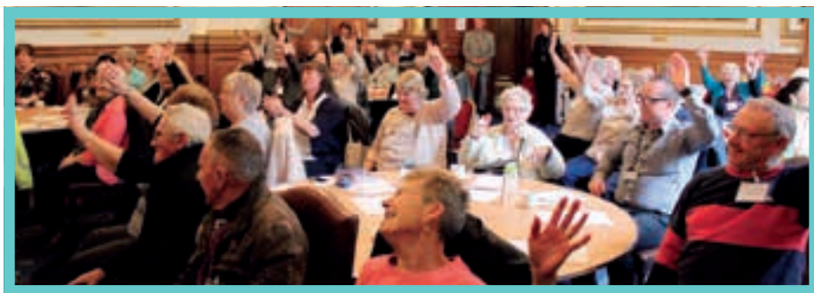
The fitness demonstration

What a year it's been for the Sheltered Housing Liaison Group (SHLG). Their first Conference in partnership with ETF and the Council saw over 50 sheltered housing tenants from a number of schemes across the city attend. Presentations were given by the City of Edinburgh Council and Police Scotland and discussion groups centred on the theme of what sheltered housing means to you and your family. The event ended with delegates participating in a seated fitness demonstration.