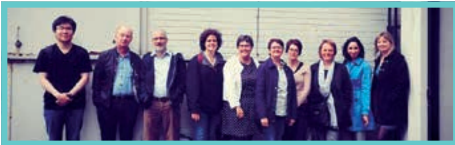
Residents meet with Commissioners as part of a walkabout

The residents carried out a survey about issues in their area and results were presented to Council staff, Councillors and the local MSP. Regular meetings are now taking place with City of Edinburgh Council officers and residents to improve housing conditions in the area. Residents had the opportunity to meet with Scotland's Commissioners for Human Rights to tell them about the project and take them on a walkabout of the area.